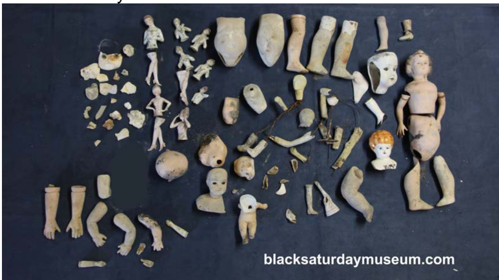
Collection of rare antique dolls found in the rubble (display)