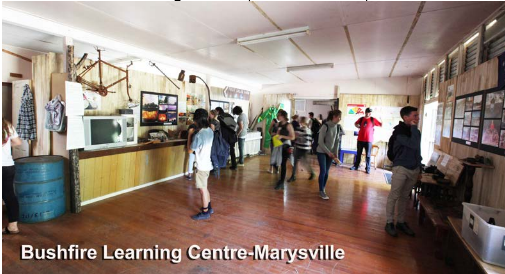
Bushfire Learning Centre-Marysville