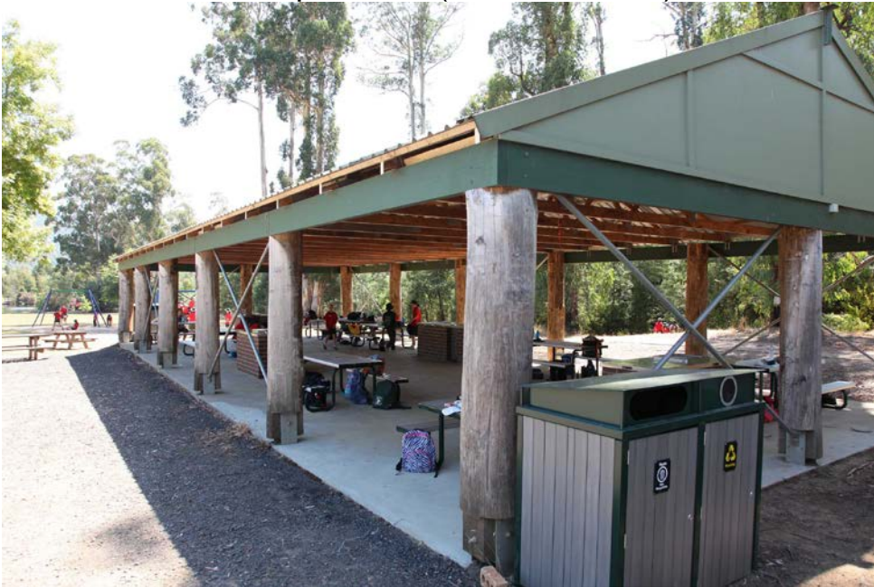
1240 Depart to Steavenson Falls (10 minute bus trip)