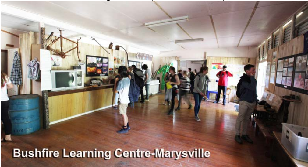
Bushfire Learning Centre-Marysville